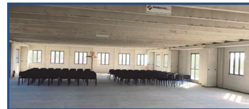
Our new building when we moved in last year (above) and today( below).