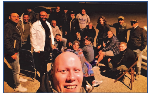
Men's Midnight Prayer on the Mountain

There has been a sense of revival in the air the past few years, and we are regularly seeing people set free from every type of chain. Our focus is apostolic: 2 Timothy 2:2 Outreach, discipleship, and trying to teach others to do the same.