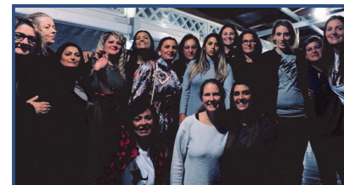
Women's Ministry Outing

Whether its on the streets or a cell group, marriage counseling or men's prayer meeting on the mountain at midnight we are sowing and watering and pruning and serving and pausing and watching in awe at what God does. Thank you for your prayers as we serve our Lord together. →