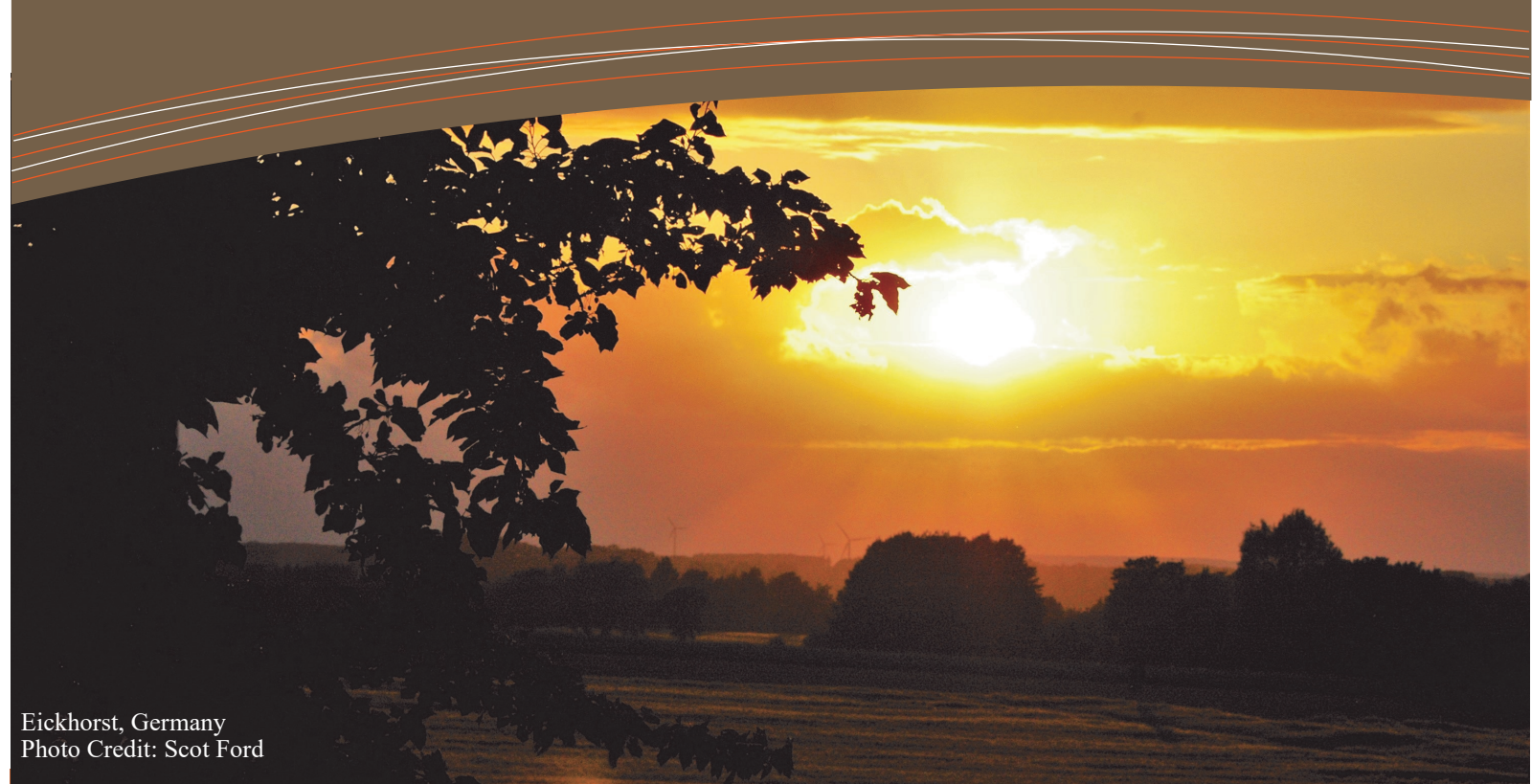
Eickhorst, Germany

For more information and online giving: www.worldoutreachcommunity.org